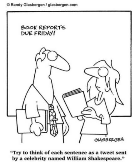
Available on: <www.glasbergen.com>. Accessed on: September 6t<sup>h</sup>, 2018.

Considering your readings and what research has been informing about this theme, it is correct to affirm that: